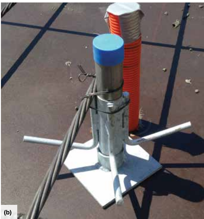
Fig. 2: Grout supported panel placement: (a) schematic; and (b) panel leveling lift system that also serves as a lifting insert

opening to traffic and about 3000 psi (20.7 MPa) at 28 days. Because the level of the upper surface can be adjusted to match the adjacent pavement, surface grinding of the panels may not be necessary to meet smoothness requirements.