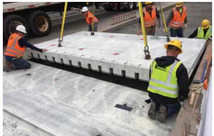
Fig. 3: Super-Slab ® with dowel bar slots at bottom of panel