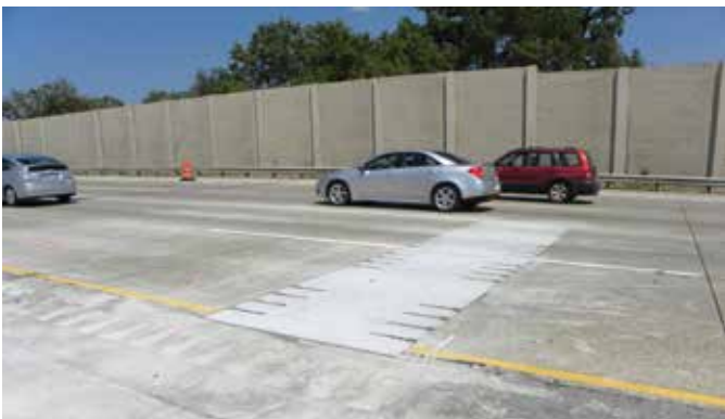
Fig. 4: A repair made using the Illinois Tollway version of a surface slot system