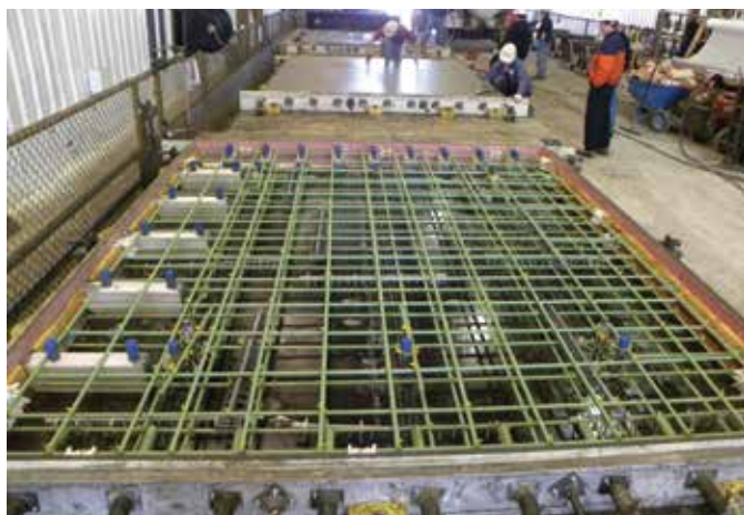
Fig. 7: Typical reinforcement layout