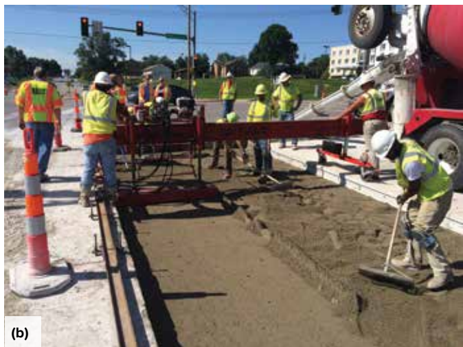
Fig. 1: Grade supported panel placement: (a) schematic; and (b) cement-treated bedding layer placement