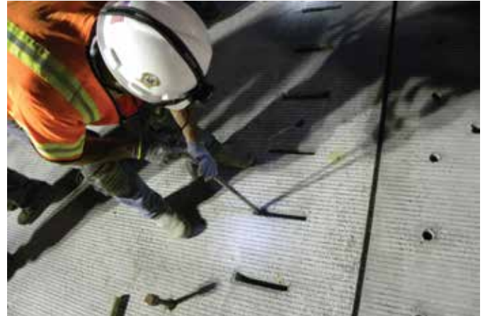
Fig. 5: Barra Glide® dowel system, showing the partially open narrow slots at the surface of the precast panel. Here, the worker is using a small diameter bar to push a dowel into the adjacent panel

Dowel bars used in highway pavement construction are smooth, cylindrical, solid steel bars conforming to ASTM A615/A615M 7 or AASHTO M 31M/M 314. 8 In addition, corrosion protection is typically provided in the form of a fusion-bonded epoxy coating. Dowel bar features critical to long-term PCP performance include 6 :