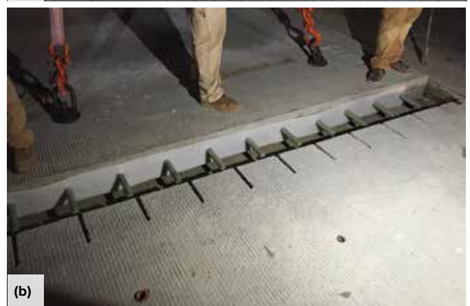
Fig. 6: California teardrop-shaped surface slot: (a) shape of slots; and (b) panel installation